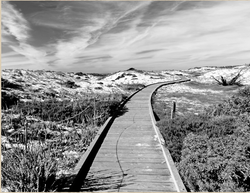
Asilomar Conference Grounds beach boardwalk, circa 2016.